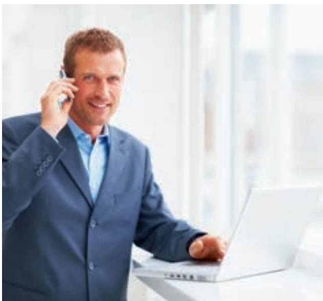
Quickly delete several messages on multiple devices once an issue is resolved.

Another productivity improving benefit of a consolidated message box is, that it results in less mailbox cleanup for messages as well as less announcement message setup. An example is provided below for a caller unsuccessfully trying to reach a recipient. When unsuccessful, the caller will have left messages (voice and email) on multiple devices. A Unified Messaging box would enable the recipient to quickly delete the multitude of messages once the issue is resolved.