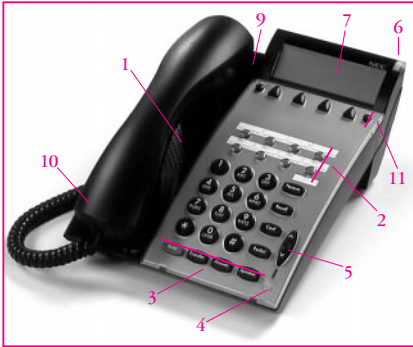
8 Button Display