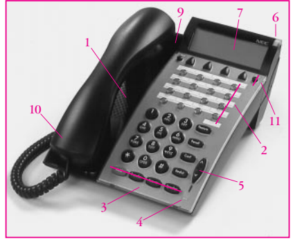
16 Button Display