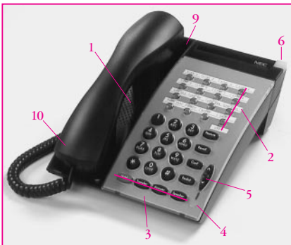
16 Button Non Display