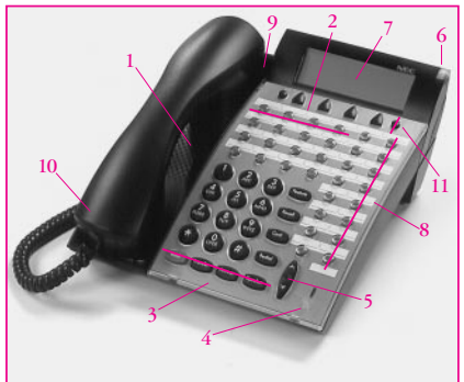
32 Button Display with 16 DSS/BLF One Touch Keys