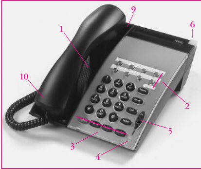
8 Button Non Display